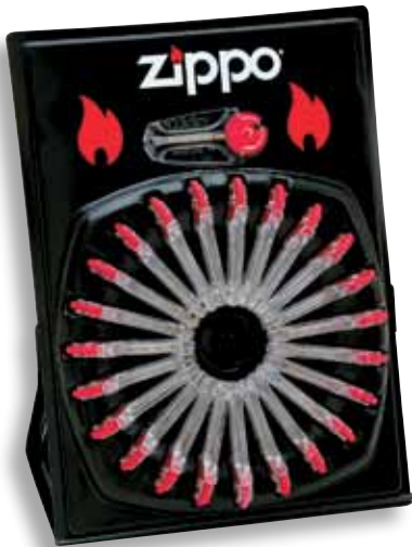
2406C 6 Flints Plastic Dispenser Packed 24 Dispensers per display box.

For optimum performance of every Zippo windproof lighter, we recommend genuine Zippo flints, wicks, and premium lighter fluid.