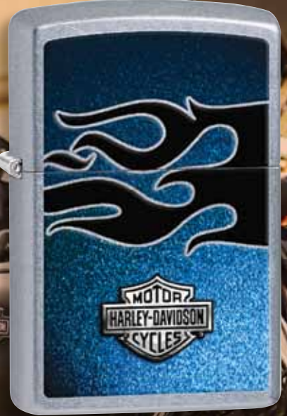
28822 Street Chrome Color Image