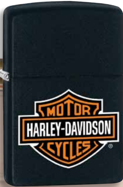
218HD.H252 Black Matte Color Image