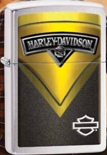
28821 Brushed Chrome Color Image