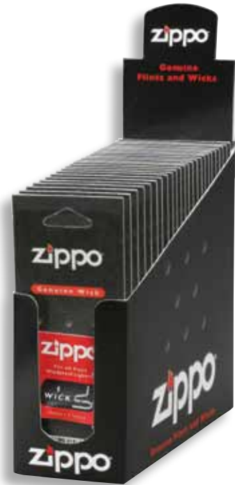
2425 Wick Individually carded, punched for pegboard use. Packed 24 Cards per counter display box.