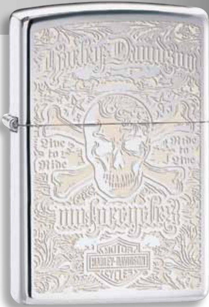
28229 High Polish Chrome Laser Engrave