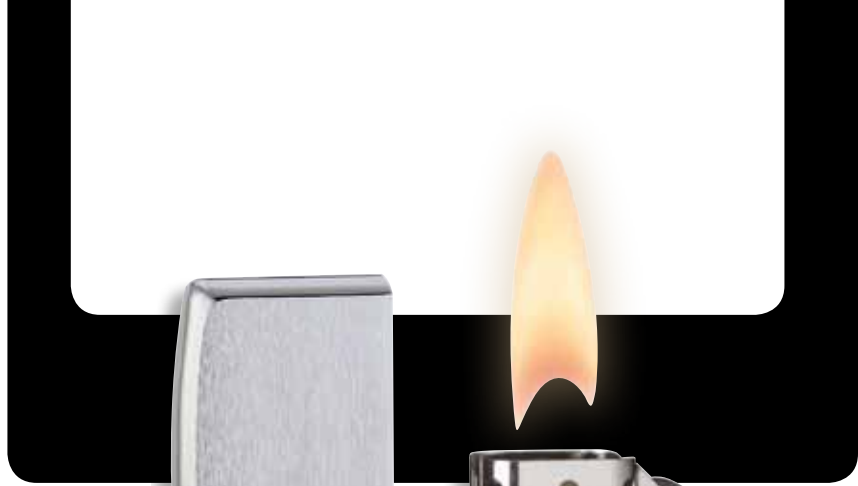
200HD.H199 Brushed Chrome Lustre