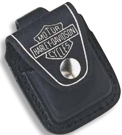
HDPBK H-D® Lighter Pouch w/ Loop - Black