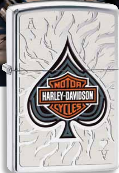
28688 High Polish Chrome Color Image / Laser Engrave