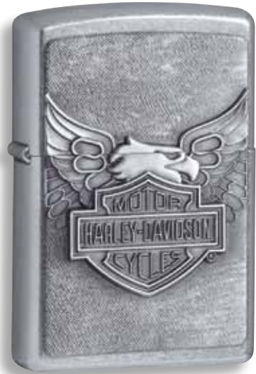
20230 Street Chrome Emblem Attached