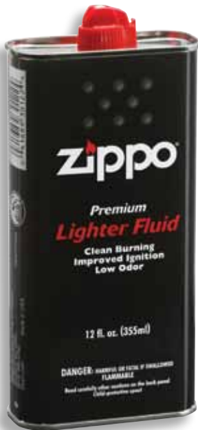
3165EX Lighter Fluid 12 oz. Shipping carton of 24.