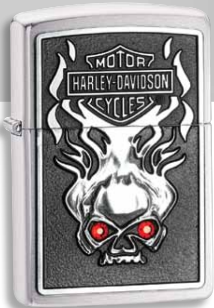
28267 Brushed Chrome Emblem Attached