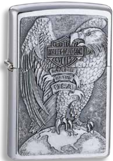
200HD.H231 Brushed Chrome Emblem Attached