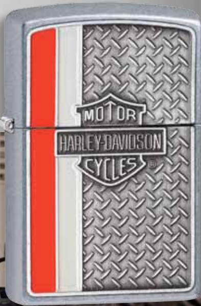
28732 Street Chrome Emblem Attached