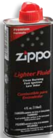
3141EX Lighter Fluid 4 oz. Shipping carton of 24.