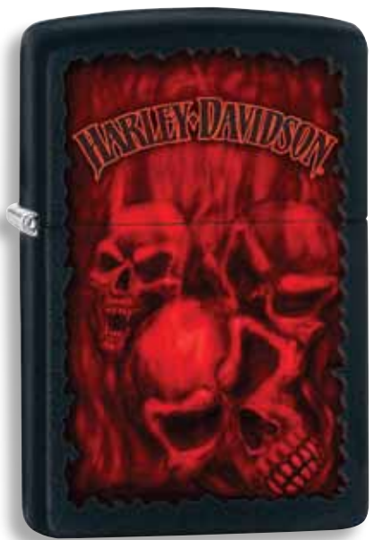
28826 Black Matte Color Image