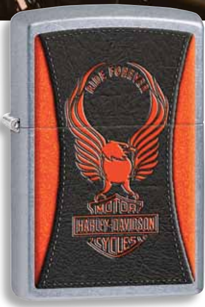
28823 Street Chrome Color Image