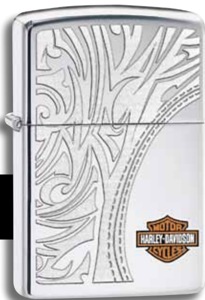
28825 High Polish Chrome Color Image / Lustre