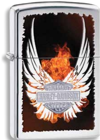
28824 High Polish Chrome Color Image