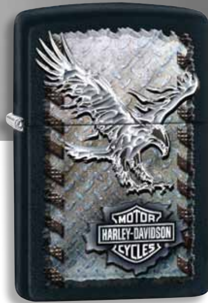
28485 Black Matte Color Image