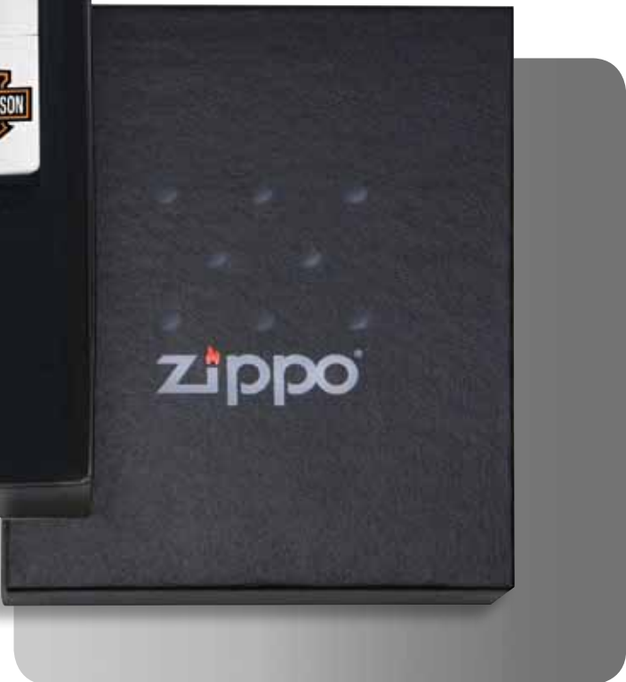
HDP6 H-D® Lighter Pouch Gift Set

Lighter Pouch Gift Set includes black leather pouch in a handsome gift box. Add any lighter to create a custom gift set. (Lighter not included.)