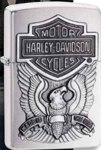
200HD.H284 Brushed Chrome Emblem Attached