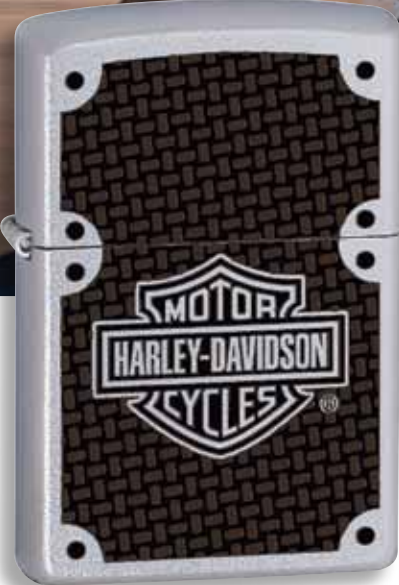
24025 Satin Chrome Color Image