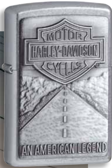
20229 Street Chrome Emblem Attached