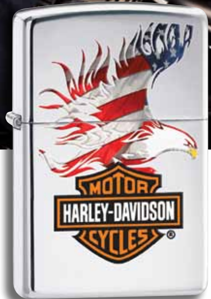
28082 High Polish Chrome Color Image