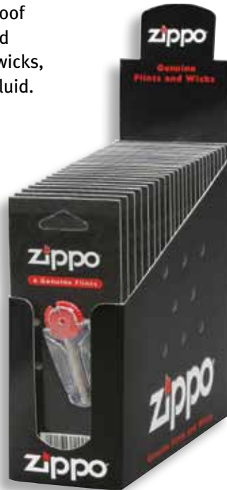
2406N 6 Flints Plastic Dispenser Individually carded, punched for pegboard use. Packed 24 Cards per counter display box.

For optimum performance of every Zippo windproof lighter, we recommend genuine Zippo flints, wicks, and premium lighter fluid.