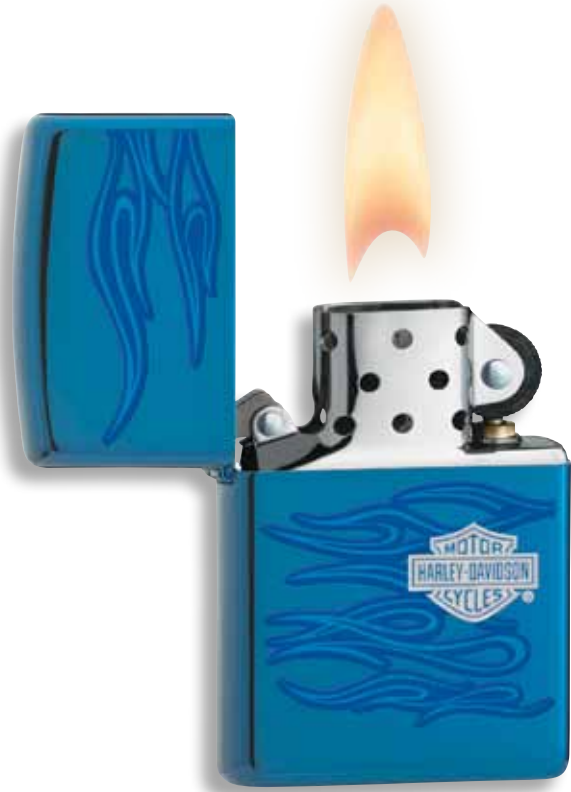
20711 Sapphire™ Color Image